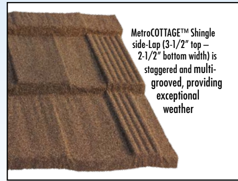
MetroCOTTAGE™ Shingle side-Lap (3-1/2" top – 2-1/2" bottom width) is staggered and multi-grooved, providing exceptional weather